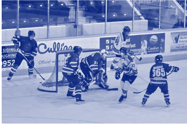
The action was fast and furious as the United Way All-Stars peppered Dean with shots throughout the game. Here - the Conservative All-Stars' defenders prepare to cycle the puck out of the zone.